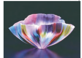
Ultimo Danza Serena by Toots Zynsky, 2000