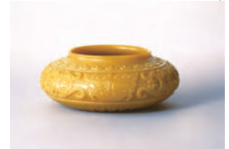
Yellow flat jar with the design of a beast amulet from the Qing Dynasty of China, 18th century