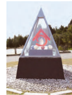
Kura (Storehouse) as a symbolic monument by Kyohei Fujita, 1997