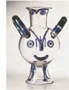
Burlesque Owl created by Egidio Costantini designed by Pablo Picasso, 1962 (Original design by Picasso applied to glass)