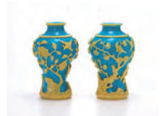
Blue vases with design of yellow flowers and birds from the Qing Dynasty of China, 18th century