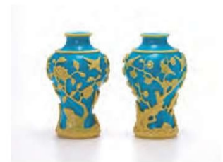
Blue vases with design of yellow flowers and birds from the Qing Dynasty of China, 18th century