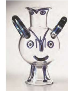
Burlesque Owl created by Egidio Costantini designed by Pablo Picasso, 1962 (Original design by Picasso applied to glass)