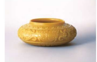
Yellow flat jar with the design of a beast amulet from the Qing Dynasty of China, 18th century