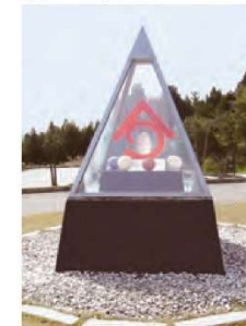
Kura (Storehouse) as a symbolic monument by Kyohei Fujita, 1997