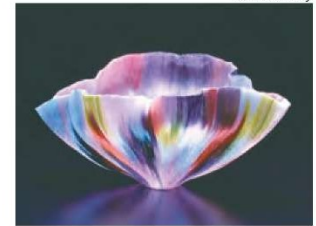
Ultimo Danza Serena by Toots Zynsky, 2000

*It was damaged by the Noto Peninsula earthquake in 2024 and removed in 2025